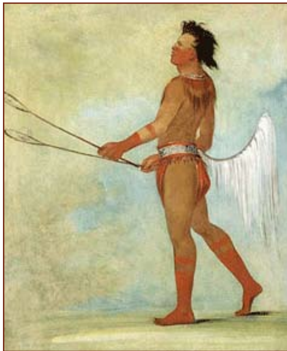
Choctaw Lacrosse Game Dress, observed and documented by artist George Catlin. Currently in the collection of the Smithsonian Institute of American Art.

Popular among many disparate tribes, lacrosse was a special passion of the Iroquois, and it was their version that gave rise to the modern sport. By the mid 1800s, the Iroquois teams were playing matches and spreading enthusiasm for the game in Montreal and other parts of Canada, in several cities in the United States, and then in Great Britain. By 1878 lacrosse had reached Australia and New Zealand. American Indian teams were barred in 1880 from international amateur competition because some of them had accepted expense money for their trips. It was not until the 1980s that the Iroquois reentered the global arena. Since that time, all-star Iroquois teams have taken part in the World Games and other international tournaments, proudly playing the sport that has remained, as a great Iroquois player has said, “ingrained in our culture and our lives.”