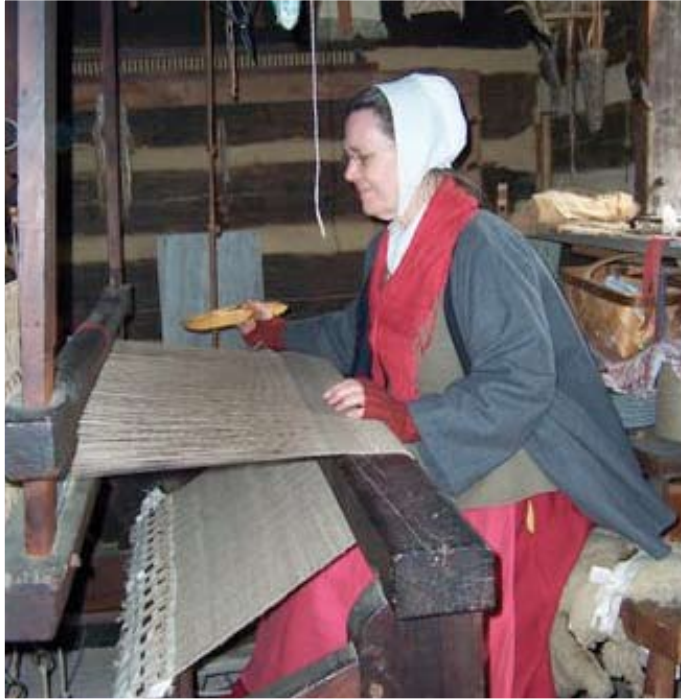
Weaving loom at Pricketts Fort