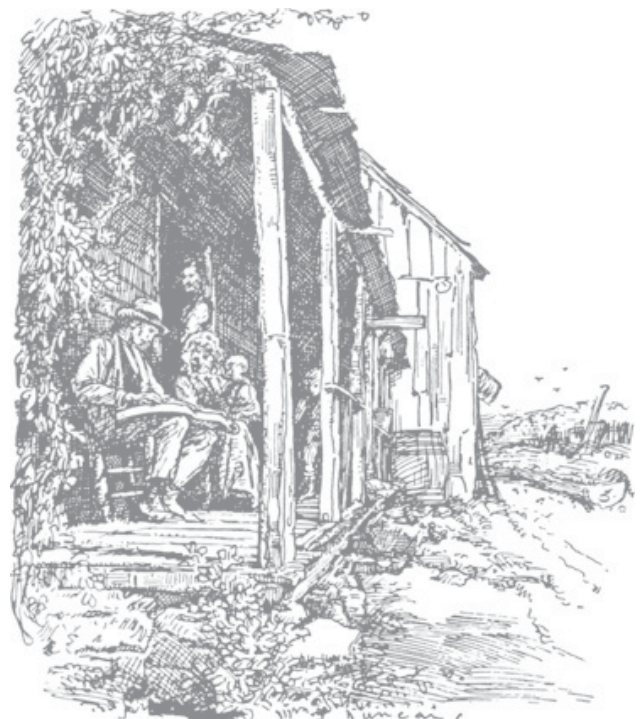
18th Century line art drawing